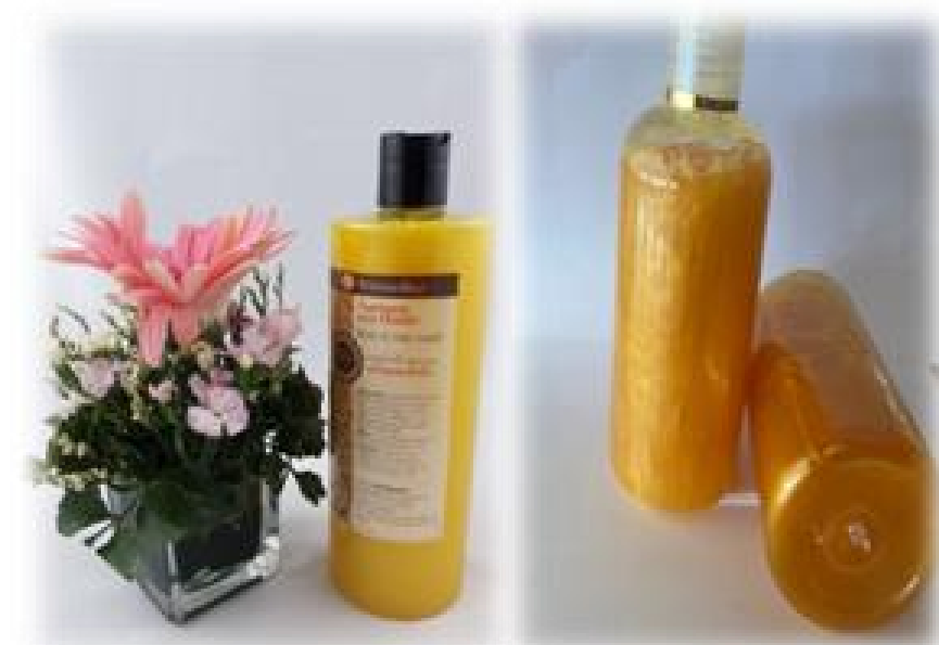
Turmeric liquid soap